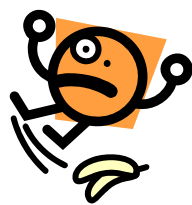
figure out what I did wrong and learn what to do instead.

Just because I slip, doesn't mean I have to fall. We can all make mistakes. I can't give up or spend